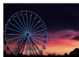
Quiz: Flags in Europe