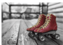
Quiz: Psychology 101 Part 2