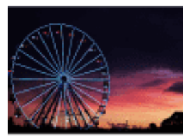
Quiz: Flags in Europe