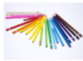
Quiz: Psychology 101 Part 2