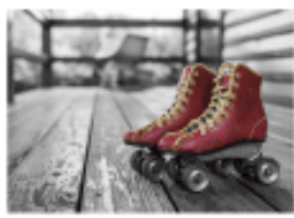
Quiz: Psychology 101 Part 2